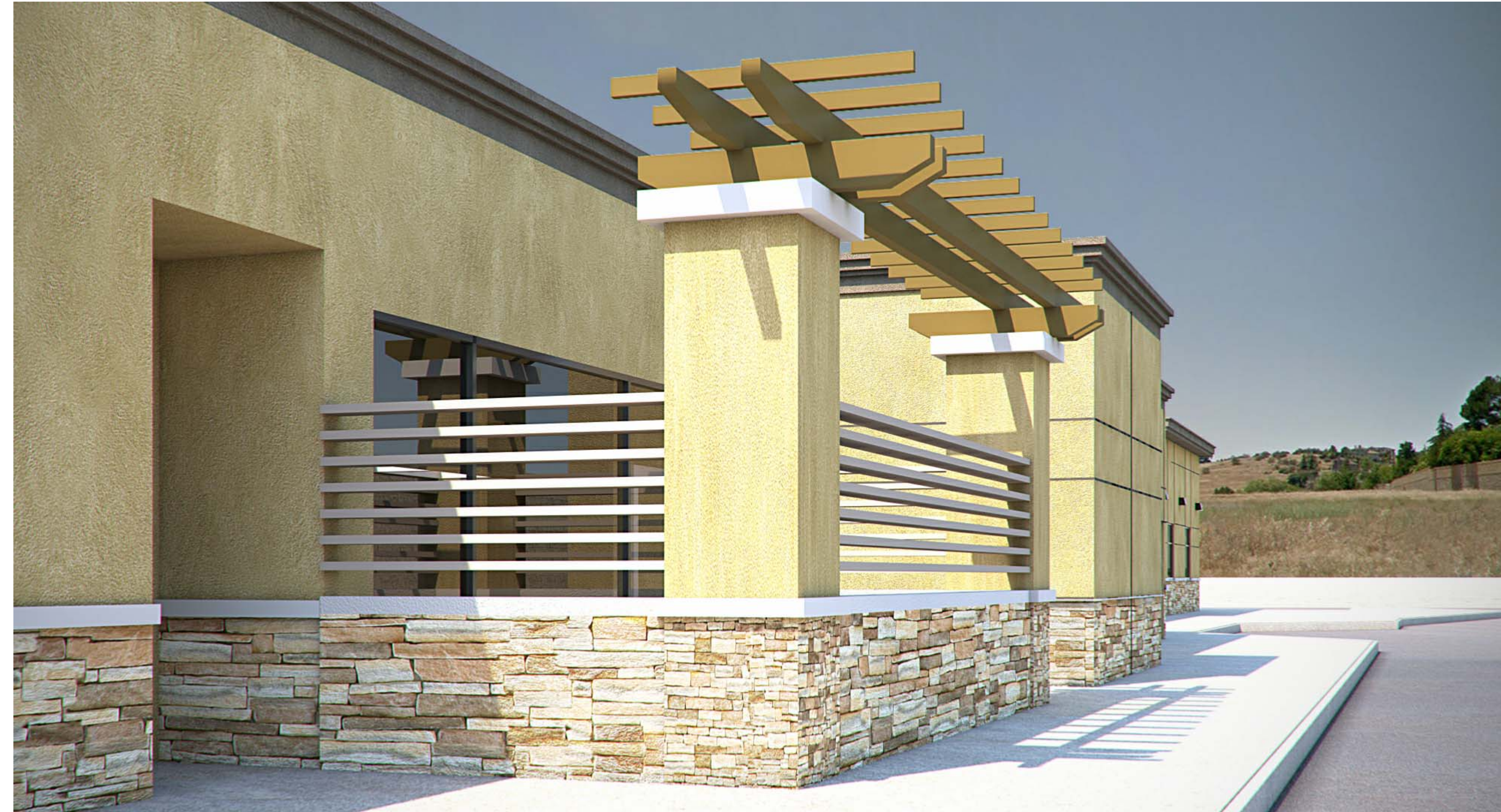
C EXTERIOR PERSPECTIVE

IF THIS SHEET IS NOT 30"x42", IT IS A REDUCED PRINT SCALE ACCORDINGLY