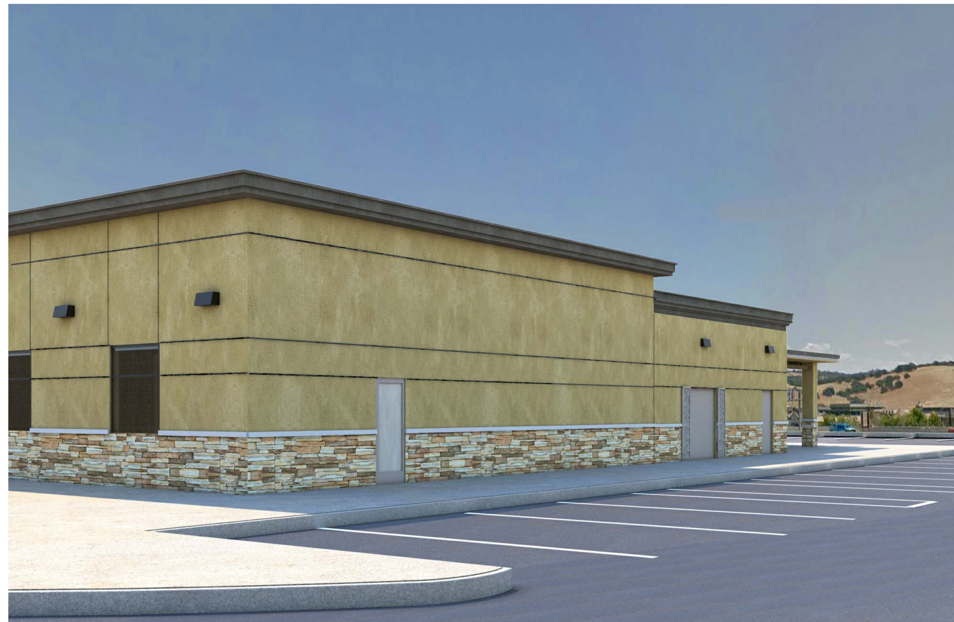
D EXTERIOR PERSPECTIVE