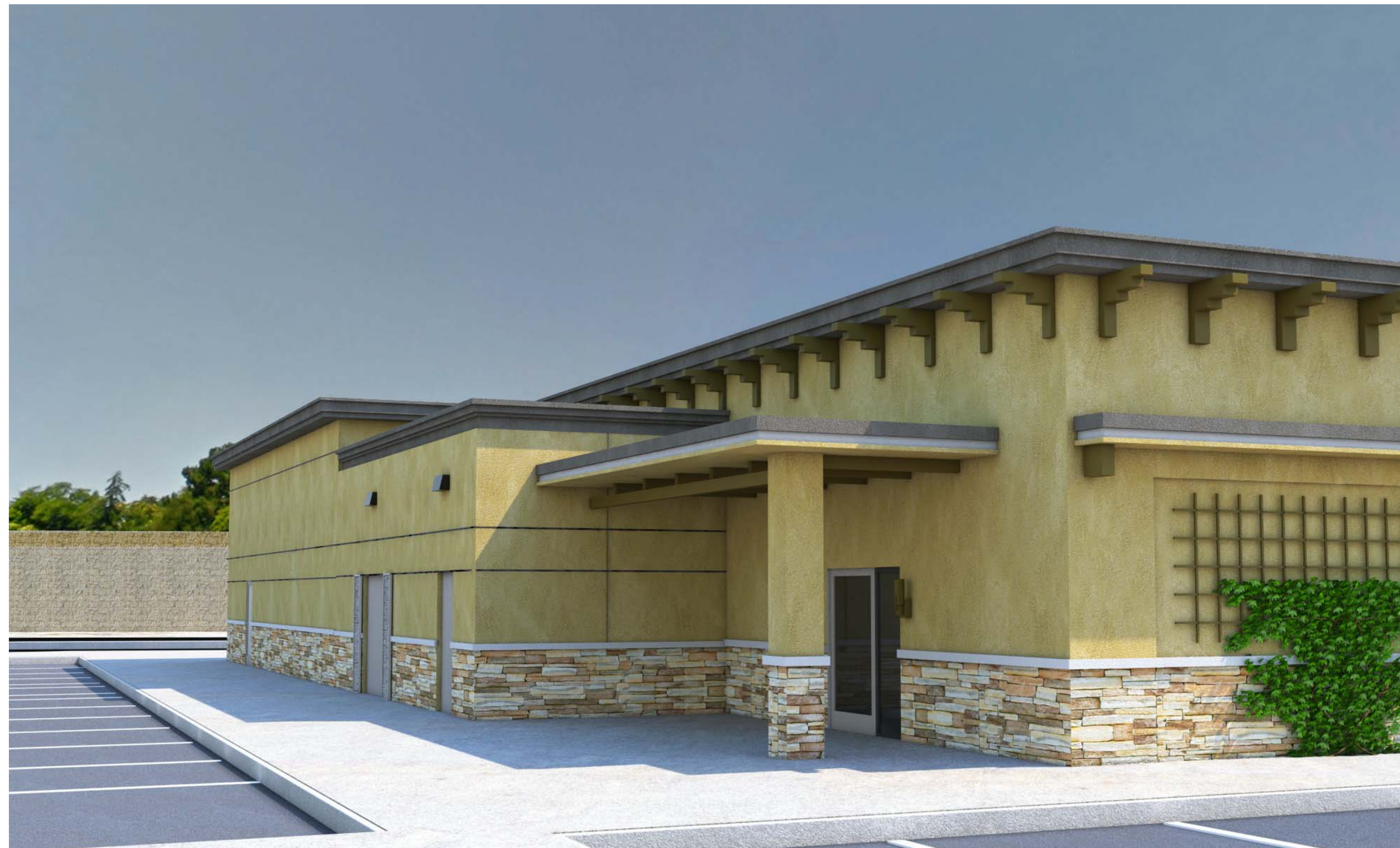
B EXTERIOR PERSPECTIVE