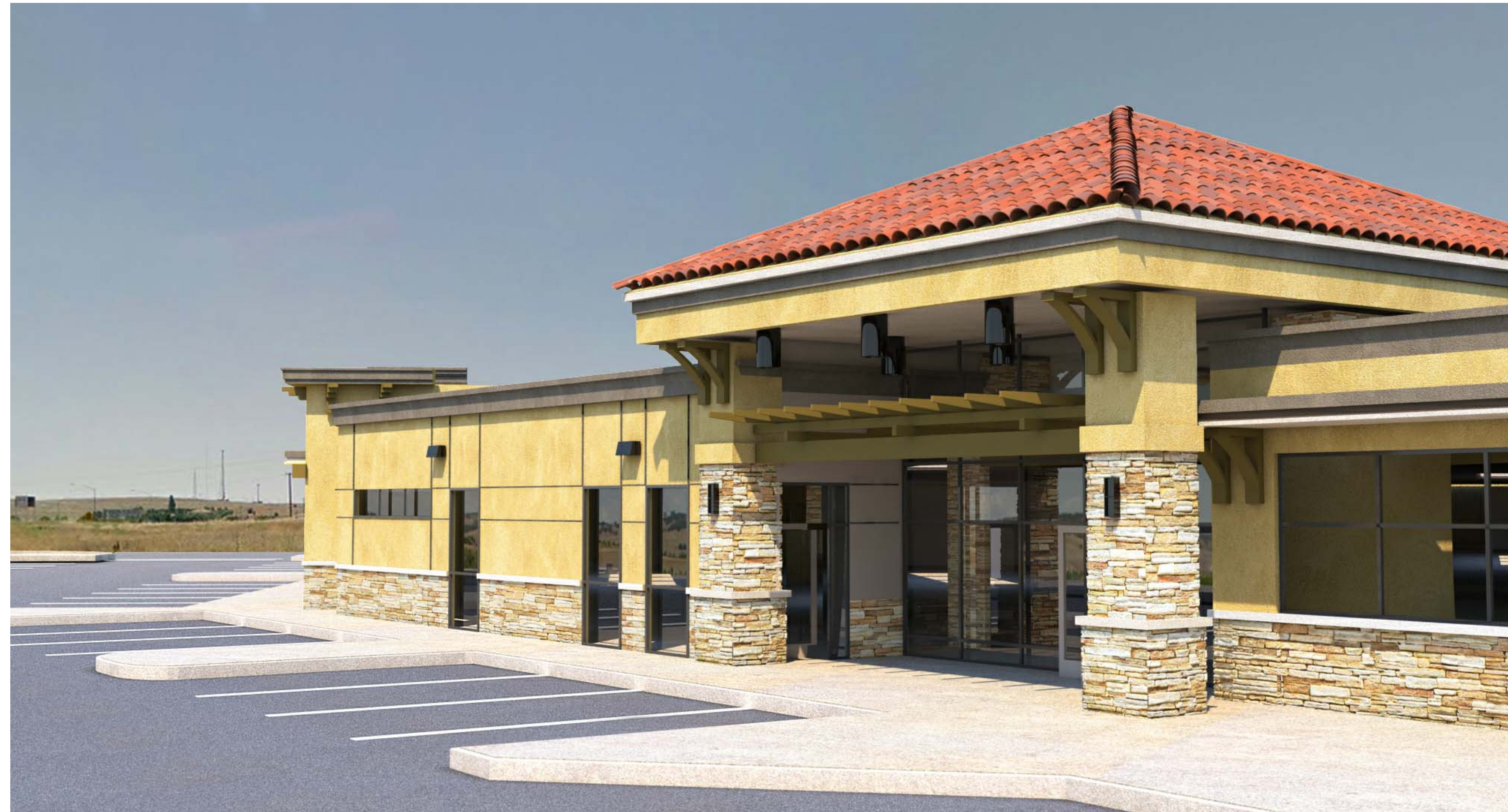
A EXTERIOR PERSPECTIVE

IF THIS SHEET IS NOT 30"x42", IT IS A REDUCED PRINT SCALE ACCORDINGLY